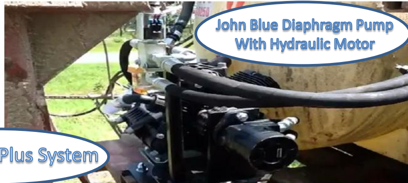
John Blue Diaphragm Pump With Hydraulic Motor