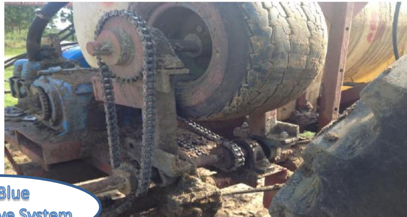
John Blue Ground Drive System